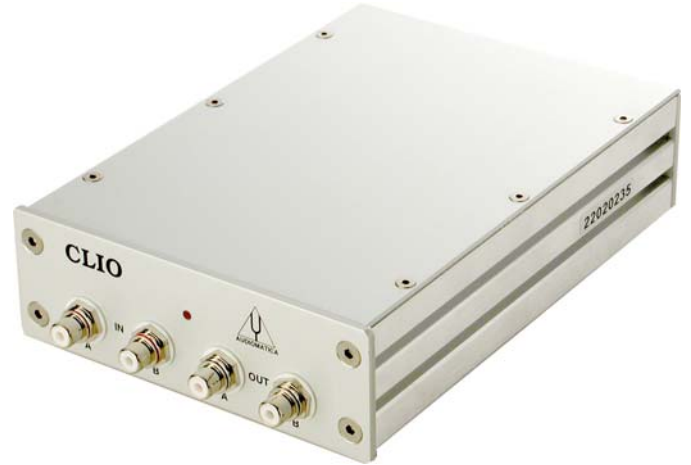
SIGNAL CONDITIONER SC-01